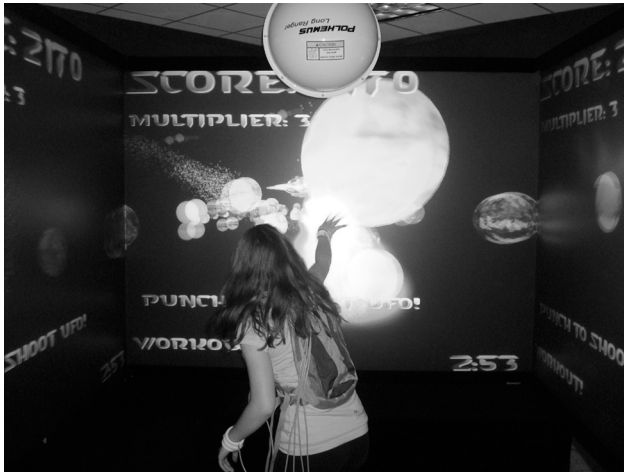
Figure 1. A user playing Astrojumper in our three-wall stereoscopic projected display. Gameplay requires rapid body movements to dodge planets and collect bonuses. During a UFO attack, the player can execute quick arm motions to throw green laser beams at the enemy spacecraft.

As quickly as new input devices are created to facilitate exercise in games, players discover ways to win without actually exercising. For example, while the Nintendo Wii allows players to engage in realistic motions such as swinging a tennis racket, it does not require accurate and realistic behavior, as frustrated players observe when they are beat by an opponent moving only their wrists while sitting on the couch. One way to prevent players from finding workarounds is to immerse them in virtual reality and tie game performance to actual, full-body activity. Astrojumper was designed and developed so that players must move not only their feet and legs, but must also engage their upper body to win the game. This is a key component to all games with a secondary purpose: the purpose must be central to the core game mechanic, in other words, the activity that players engage in more than any other. Balancing a game's purpose with fun is challenging, requiring game designers to focus on how to achieve gameflow while engaging players in the main purpose of the game. Astrojumper achieves this balance by requiring full-body motion to play, which encourages exercise, while adapting the game to player performance, becoming more challenging as players excel or slowing down as players make mistakes.