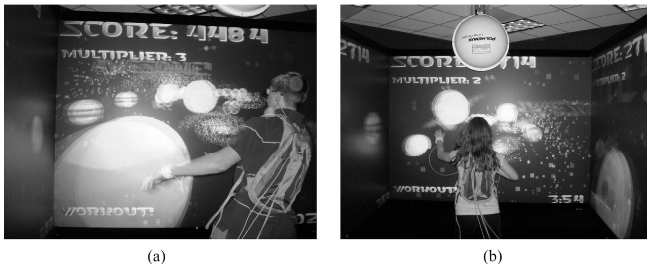
Figure 2. (a) When playing Astrojumper , the user needs to dodge planets that are speeding toward him or her. (b) The user can accumulate score multipliers by tapping gold suns that appear periodically.

a dual-flow model that balances the psychological flow of gameplay (attractiveness) and the physiological flow of exercise (effectiveness) (Sinclair et al., 2007). Putting these models into practice, we carefully considered Sweetser's gameflow criteria during the design of Astrojumper . Additionally, to balance the dual flow of gameplay, Astrojumper adjusts the difficulty level dynamically based on the player's performance. This gameplay mechanic ensures the exercise will be appropriate for players of varying physical fitness, and also supports an individual player's skill development over time.