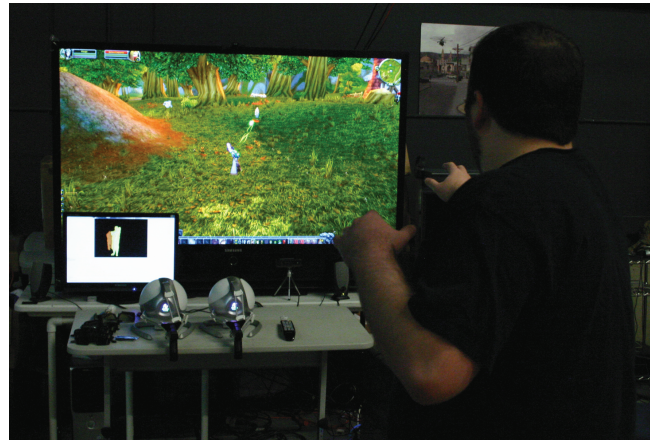
Figure 1: A user casting a spell using a “push” gesture in World of Warcraft, an off-the-shelf online video game that was not developed to support motion sensing devices. FAAST can be custom-configured to detect specific actions and bind them to virtual keyboard and mouse commands that are sent to the active window.

framework, and enables customizable body-based control of PC applications and games using an input emulator that generates virtual mouse and keyboard events.